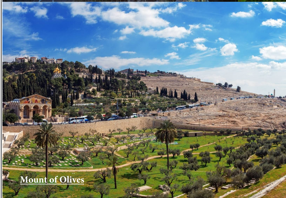
Mount of Olives