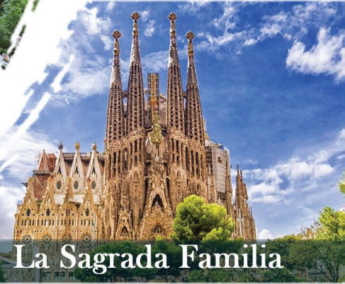
La Sagrada Familia