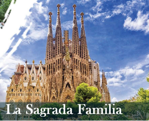
La Sagrada Familia