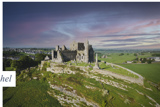
Rock of Cashel

Day 5: October 21st: Wexford / Cashel / Cork: We begin our day with a visit to the Irish National Heritage Park, an open-air museum that brings to life over 9000 years of Irish history. Continue to the Rock of Cashel, a monumental 12th century complex dominating the surrounding landscape. Tradition holds that it was here where Patrick first used the shamrock as an image of the Trinity and converted the pagan King of Munster. It hosts one of the most remarkable collections of Celtic art and medieval architecture in the region. After exploring this unique and historic location we will proceed to our hotel for dinner and overnight.