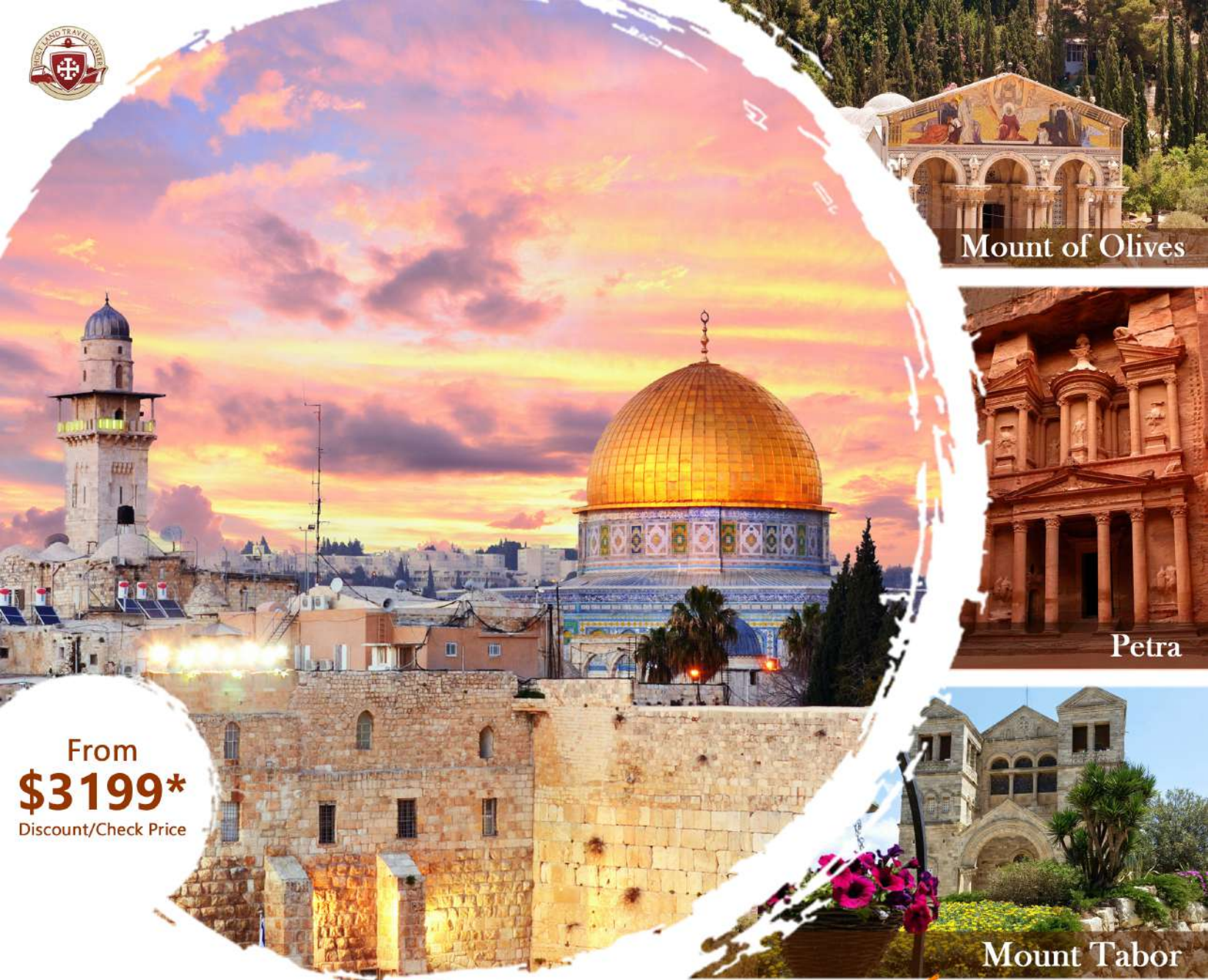
Mount of Olives